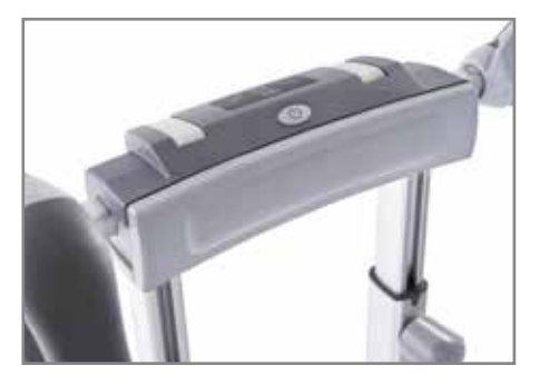
Comfortable cusioning for resting the operating unit on the thigh while climbing the stairs