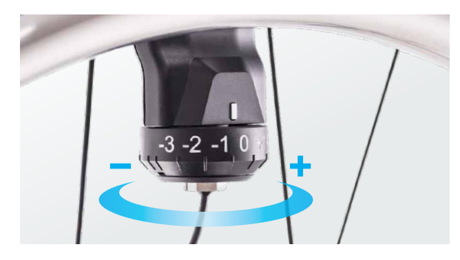
Adjustable sensitivity of the drive sensor in seven steps