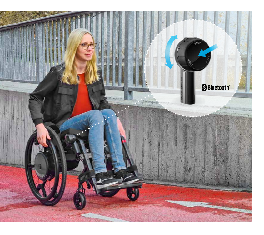
With the optional Cruise Mode function (DuoDrive) it takes just one twist on the control unit to maintain a permanent speed. This can be very helpful, especially on extreme slopes.