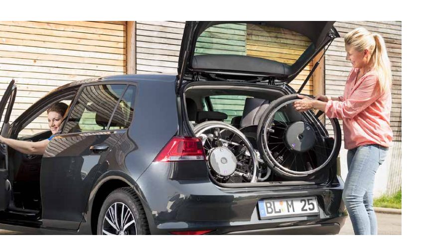
The drive wheels of the e-motion can be removed in a single movement and fit into any car