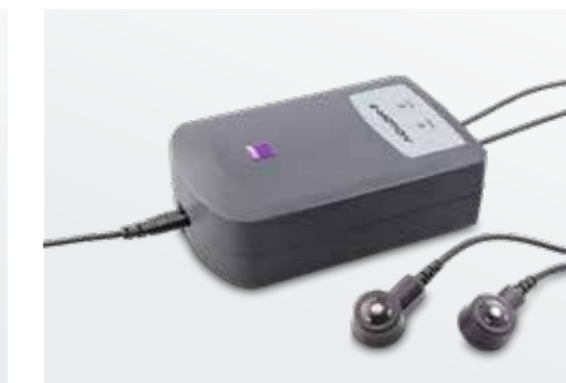
Automatic battery charger: Automatically adapts to the mains voltage and charges both e-motion batteries in a few hours (included in the scope of delivery)