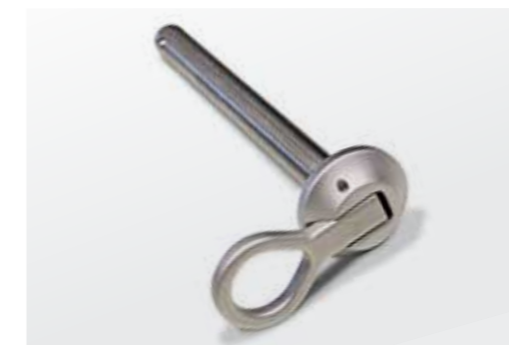
Ergonomic stub axle: Facilitates unlocking and removing the e-motion wheels from the wheelchair