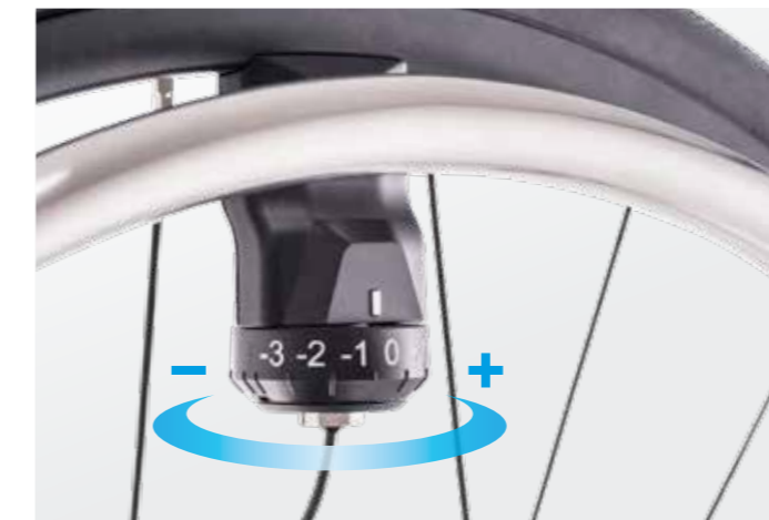
Sensitivity of the push rim sensors adjustable in seven steps

The e-motion is flexible: it is compatible with a wide variety of wheelchair models and can be adapted to your individual needs. The sensitivity of the push rim sensor can be adjusted independently on both drive wheels. So more or less strength in one arm is not a problem. Your specialist dealer or therapist also has the option to carry out further adjustments to your e-motion so that it is optimally adapted to your needs and driving style. The e-motion is available in three wheel sizes and can be equipped with ergonomic push rims on request. This ensures optimum grip in every driving situation.